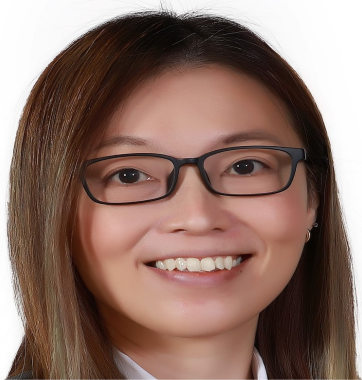
Care Corner Singapore