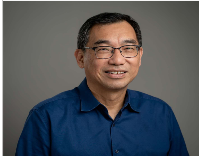
Fei Yue Community Services