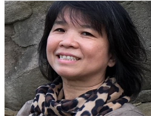
Institute of Mental Health