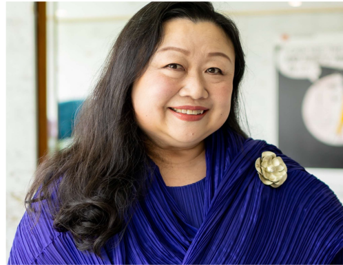
United Women Singapore