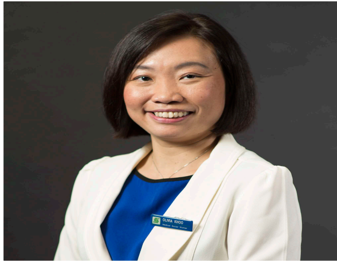
Singapore General Hospital