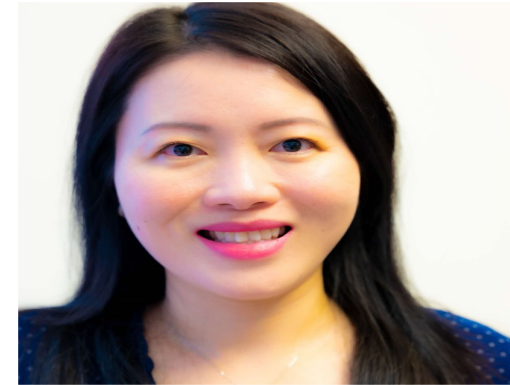
Singapore Council of Women's Organisations