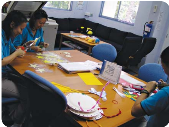
Staff room at a private premises

Comfortable areas are allocated for staff to attend to their personal needs and to interact with each other and parents.