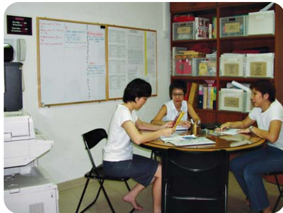
Staff room at a HDB void deck centre