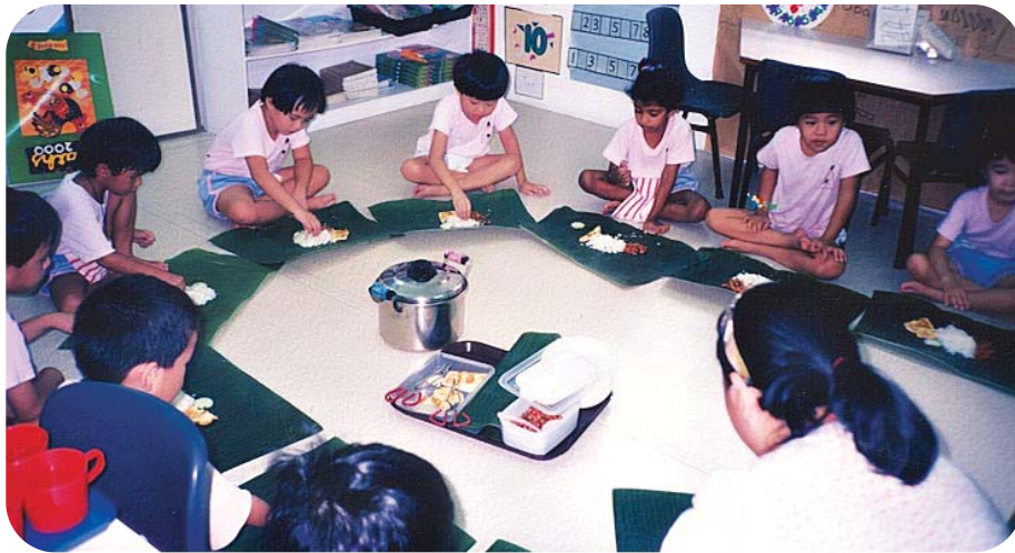
Cultural diversity is considered in menu planning.