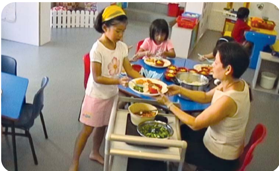
Attractive and appealing food can stimulate appetite and interest children in trying different types of food.