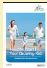
'Healthier Child, Brighter Future'