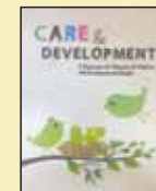
'Care & Development' Resource Kit